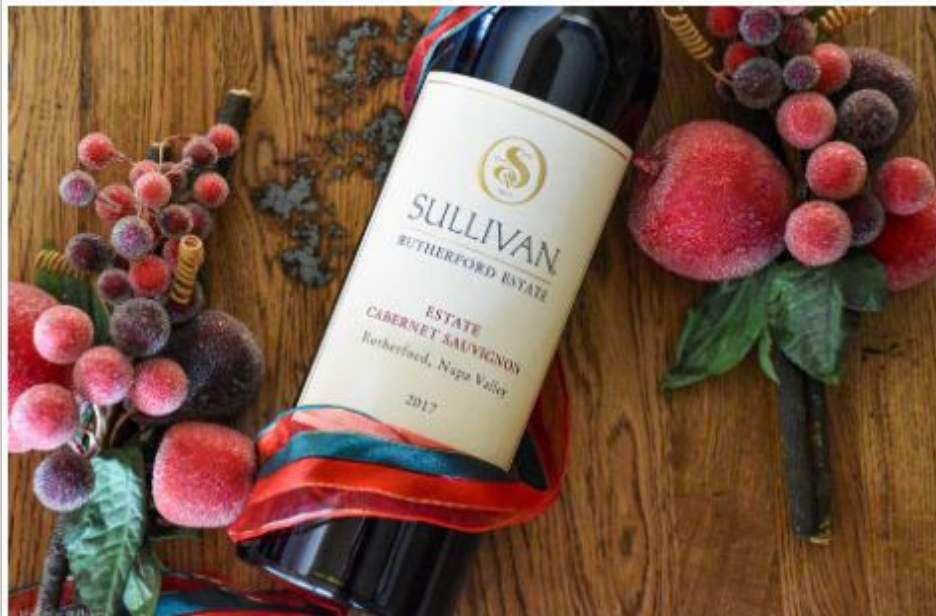
Sullivan Rutherford Estate Cabernet Sauvignon | SULLIVAN

These are cellar worthy wines, age them for ten or more years for maximum enjoyment.